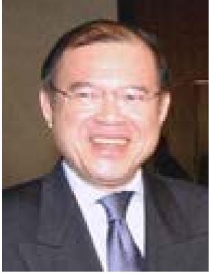
Dr. Supachai Panitchpakdi, Former Secretary, General of UNCTAD, Director, General of the World Trade Organization

Supachai Panitchpakdi has been Secretary – General of the United Nations Conference on Trade and Development (UNCTAD) since 2005. He was appointed to a second term, which runs until next year, at the UN General Assembly in 2009.