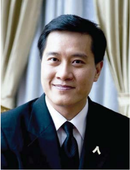
Mr. Weerasak Kowsurat Vice Chairman, Member of Nomination & CG Committee, Thai Institute of Directors

Weerasak Kowsurat, formerly served as Thailand Minister of Tourism and Sports, Who later became Chairman of the Board of the Sports Authority of Thailand and also Chairman of the Board of the Tourism Authority of Thailand. Vice Minister for Culture and Vice Minister for Social Development and Human Security, He once serve as Deputy Secretary General to the Prime Minister in International Affairs. Twice elected Member of Thai Parliament and was recorded the youngest Secretary to the President of Thai National Assembly who ex officio Speaker of the Senate and Chairman of the Constitution Tribunal at the age of 24.